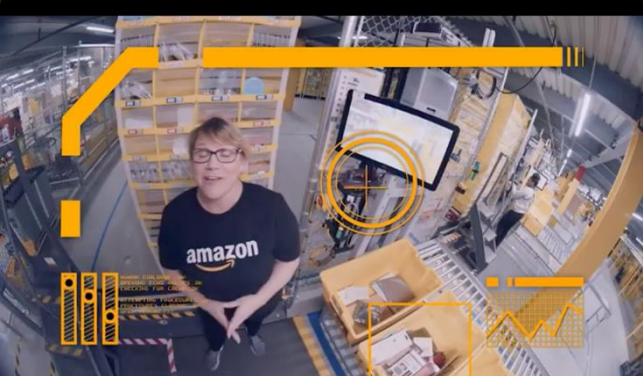
Source: Screenshots of robotic stow stations from a YouTube video posted on the 'Inside Amazon' Channel. 33

This is the same at pick – the department that inventory travels to after it has been stowed. The pick workstation looks very similar to the stow workstation, but here associates aren't putting inventory inside the pod, they are taking it out. It isn't a complex task, "we don't have to think about it, we just do it" explains Jane. But the "rate" – that is the number of items processed per hour – is usually high. "You cannot take breaks, because if you disappear for 2 or 3 minutes, your rate goes down". If your rate is too low, you can get a negative ADAPT.